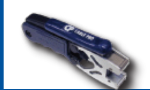
CPLCRBC-B Utilize This Tool

The DB6PL2 is our Plenum "F" type connector that fits most RG6 Plenum coaxial cable.